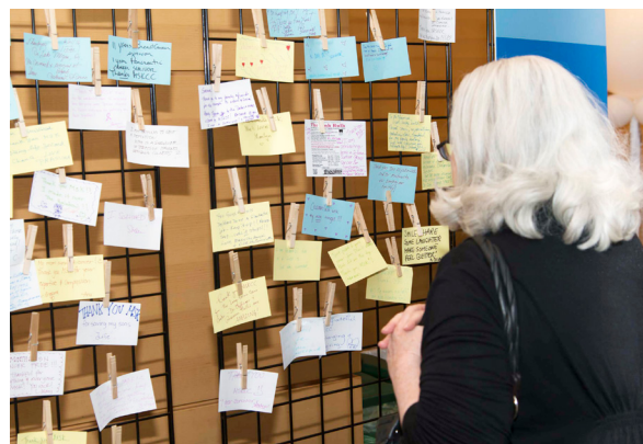
Participants at an MSK event in 2016 to mark National Cancer Survivors Day wrote notes to honor loved ones and care providers.

To expand survivorship services to underserved populations, the Survivorship Center has partnered with the Queens Cancer Center (QCC) to establish a primary care clinic within QCC. Cancer patients who do not have a primary care physician and newly diagnosed patients are eligible to participate. The primary care clinicians treat comorbidities, recommend cancer surveillance for potential second cancers, manage long-term and late effects of cancer treatment, provide health promotion counseling, and refer patients to supportive services as necessary.