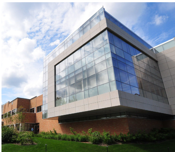
MSK Commack expanded by 38,000 square feet in 2016, nearly doubling in size.