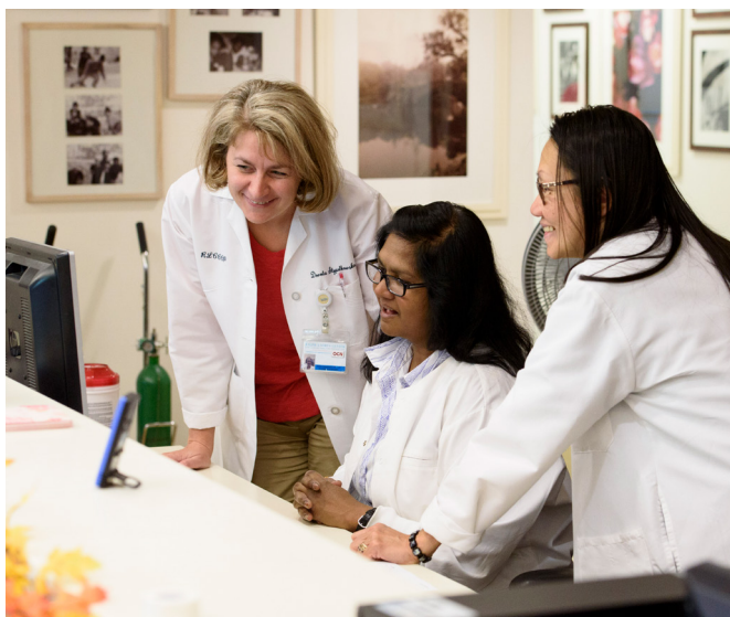
MSK partners with the Ralph Lauren Center for Cancer Care in Harlem to bring high-quality cancer care to all.

The Ralph Lauren Center for Cancer Care (RLC), a New York State Article 28 Certified Diagnostic and Treatment Center, receives support from MSK to provide compassionate cancer diagnosis, prevention, and treatment services to all. Located in Harlem, the RLC further seeks to address health disparities of increased death from cancer and other chronic diseases experienced by African Americans, Latinos, and other racial and ethnic minorities; individuals of low income; and those without adequate health insurance. At the heart of its work is a patient care navigation model through which the RLC delivers a comprehensive, personalized approach to care.