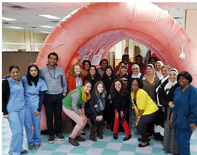
Staff members from MSK's Immigrant Health and Cancer Disparities Service educate the public about colorectal cancer using an inflatable, walk-through colon.

In 2015, ICCAN worked with 300 community-based organizations and helped more than 750 adult patients and 30 pediatric cancer patients and families. ICCAN recently established the Coalition for Housing and Health with other medical, legal, and housing professionals to address pressing housing needs among underserved patients with cancer and other serious medical conditions.