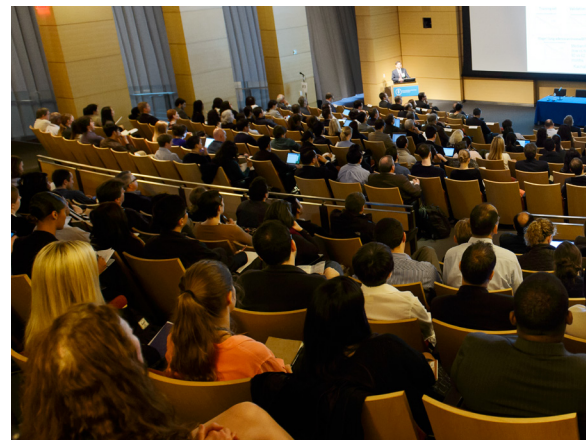
MSK’s Continuing Medical Education courses draw participants from around the world.

The Department of Nursing offers short-term, individualized study programs for nurses from around the world. In 2015, a total of 17 nurses participated in short-term study programs. We also hosted brief programs for 154 undergraduate, 127 graduate, and five wound/ostomy certification program nursing students. Two students from the College of New Rochelle received preceptorship training by nurse practitioners at BECH.