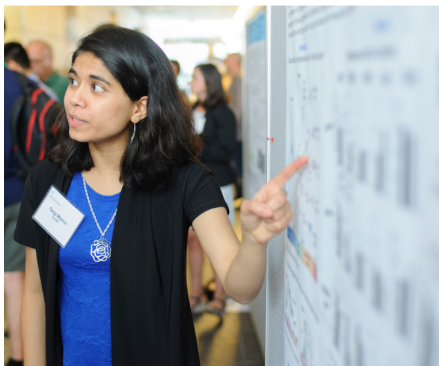
MSK offers first-rate research training for postgraduate biomedical scientists and for clinician-scientists who are in the training stages of their careers.