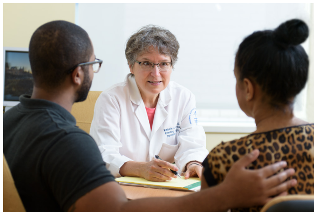
Women who are uninsured may be eligible for free breast and cervical cancer screening at MSK’s Breast Examination Center of Harlem.

Uninsured women who come to BECH for breast and cervical screening and meet certain eligibility criteria receive screening for colorectal cancer through the New York State Cancer Screening Program. BECH nurse practitioners also provide information to women and their partners